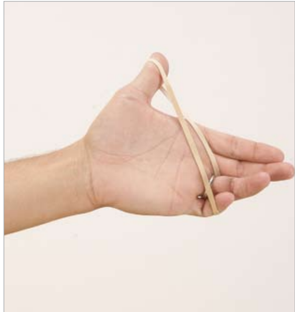
11b. Starting with the thumb flexed across the palmar surface, extend the thumb as far as possible.