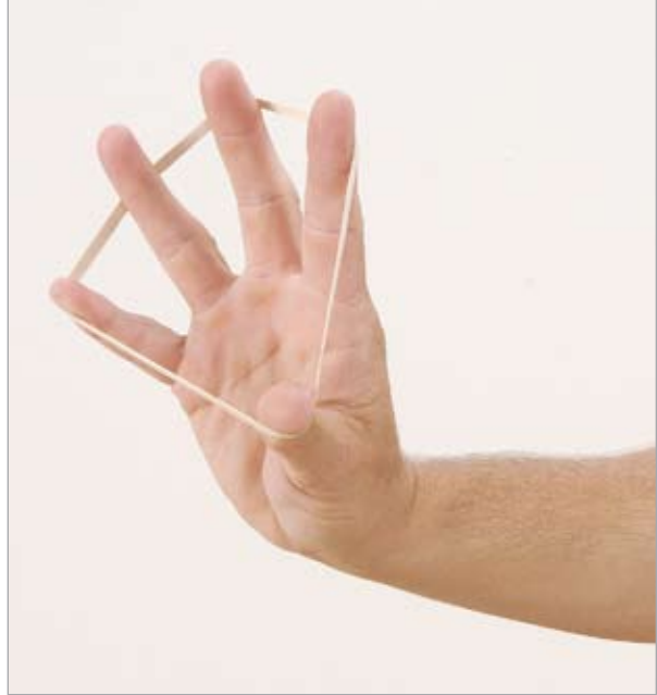
10b. With the elbow extended throughout the exercise, extend the fingers as far as you can against the resistance of the rubber band, and at the small caption spaces can explain how the position starts or finishes depending on what is shown in the photos