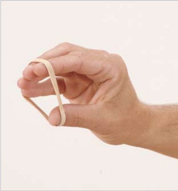
Figure 10a. These exercises focus on the phalangeal extensors and may be felt along the lateral epicondyle. Begin by holding the rubber band so that it is wrapped around all the fingers and thumb