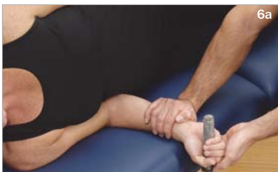
Figure 6a. This time, begin with the thumb pointing down. 6b. At the end movement, return to the start position with thumbs up, resisting the movement again.

“For these exercises, perform 8 to 10 repetitions and alternate between the previous exercises for a total of three to four sets.”