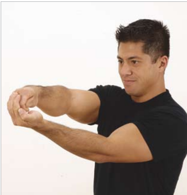
Figure 3. The client makes a tight fist with his thumb on the inside. Make sure his elbow is locked.