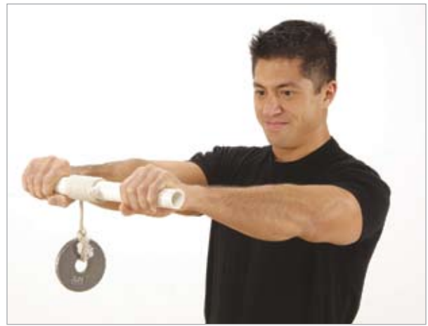
Figure 8. Grasping the tube with the weight on the floor, begin to roll the rope around the tube clockwise , pulling the weight up.