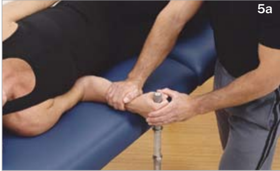
Figure 5a. Lie on your side on a therapy table. Your elbow is bent at 90 degrees, and tucked under your side. 5b. Begin rotating the hand into supination, taking care not to flex or extend the wrist.