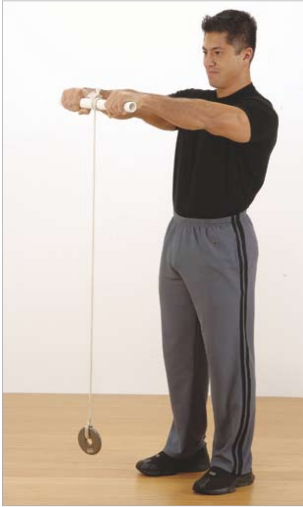
Figure 7. Begin with a 2 to 3 pound weight. You can add more weight as you get stronger.