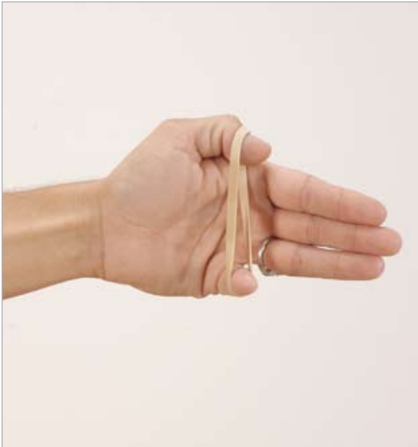
11a. This exercise helps strengthen thumb extension. Hold the rubber band by the pinky finger and wrap it around the palmar side of the hand.